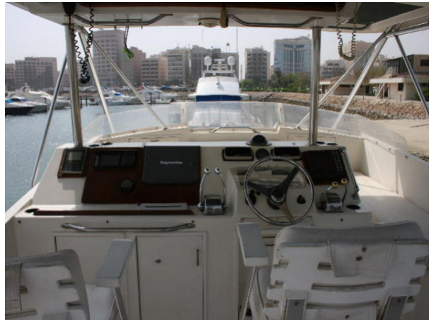
F/B looking fwd